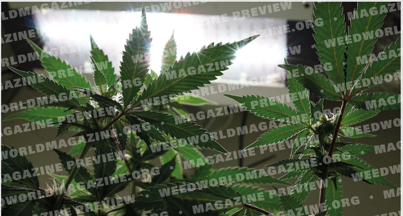
Solar System 550 LED in white light mode (see purple mode on opposite page)

White spectrum LEDs are the most user friendly to grow with. The spectrum usually appears as warm white, similar to a summer evening glow. It's an easy light in which to check the